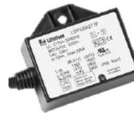
Surge Protector 20kV, 10kA HL-LSP10GI277P