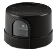
Twist lock long life photocontrol Multi-volt, fail-on, 8A at 120V and 5A at 277V HI-LL-127-15-BK-12