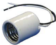
Mogul Socket LH-MOE-01