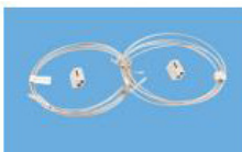
HF-WCH Wire Cable Hanging Kit (2 pcs per kit)