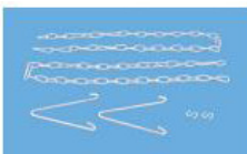
HF-2CV (2 foot) HF-3CV (3 foot) Hanging Chain & V-clips