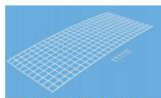
H2L-WG & H4L-WG Wireguard Actual wireguard appearance may vary