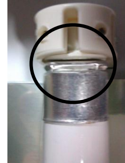
Diagram 2-T5 lamp seating

The dimple on the lamp base is aligned with the slot in the lamp holder.