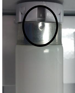
Diagram 1-T8 lamp seating

⚠ WARNING: Improper seating of lamps can create a fire hazard. Whether field or factory installed, ensure lamp position is correct before energizing fixture. See Diagrams 1 and 2.